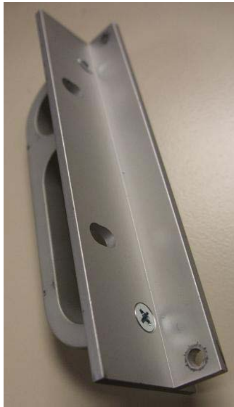
Photo 5 - Handle installed on Rack Bracket