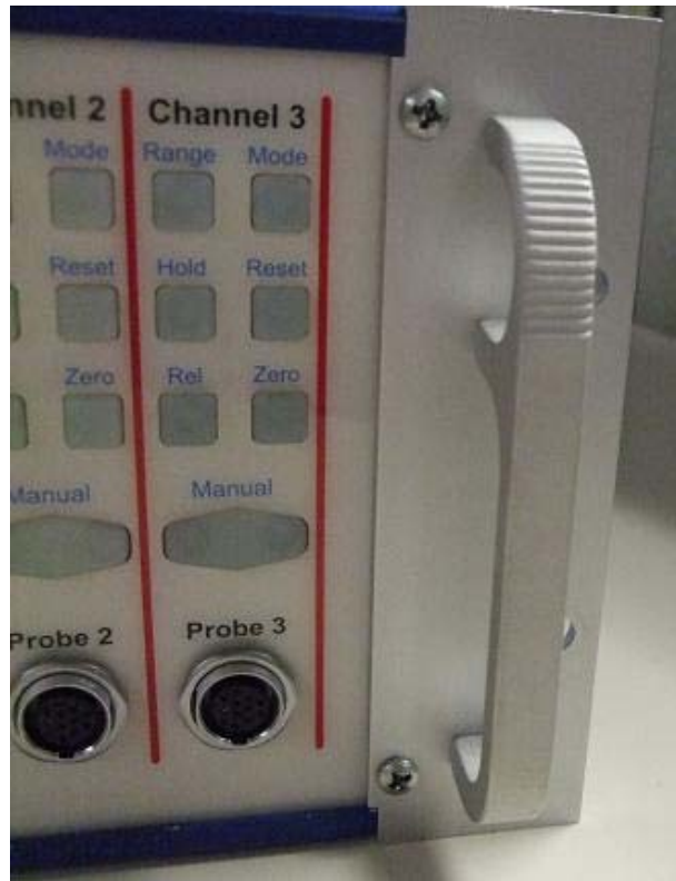
Photo 7 - Front screws in bracket