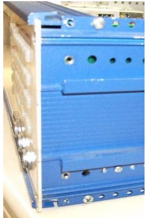
Photo 3 - Corner piece removed