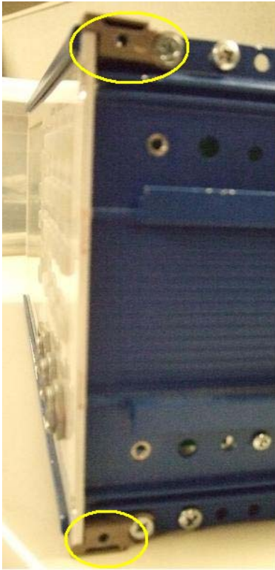
Photo 4 - Spacers Installed on case