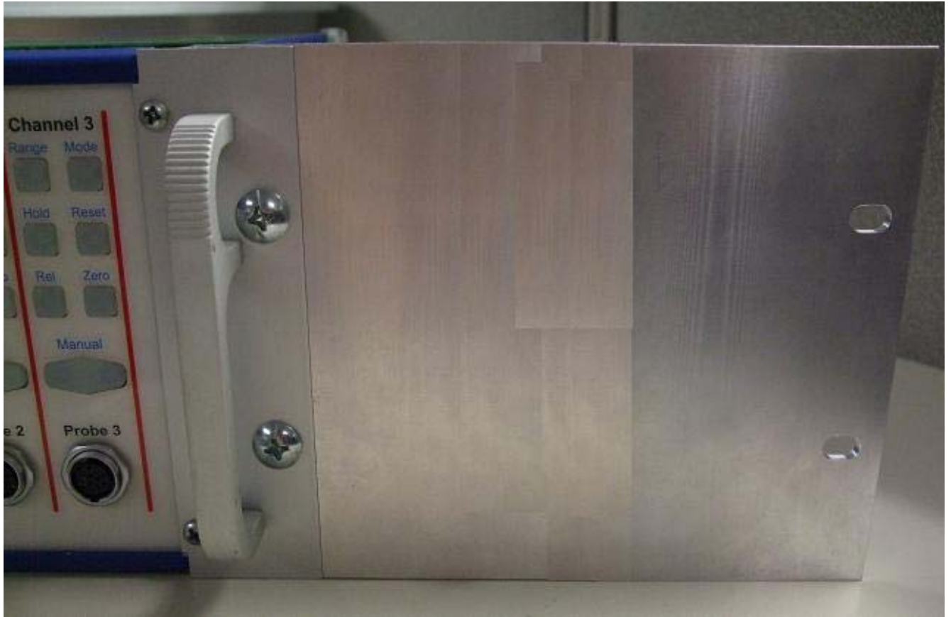
Photo 8 - Extender plate installed (right side option shown, plate may be installed on left side if desired)