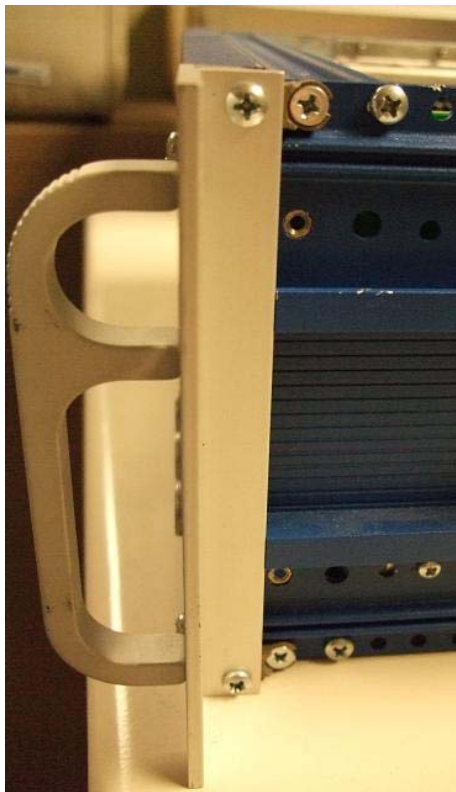
Photo 6 - Side screws w/star washer in bracket